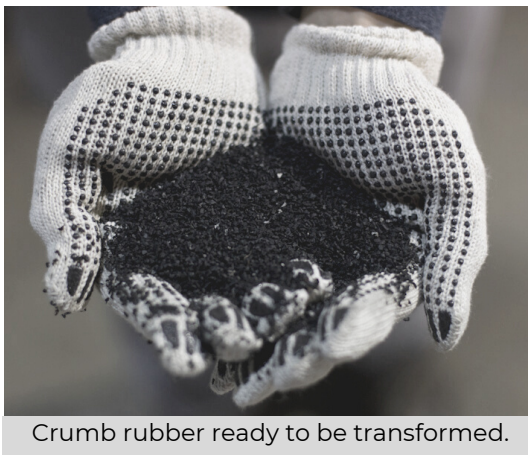
Crumb rubber ready to be transformed.